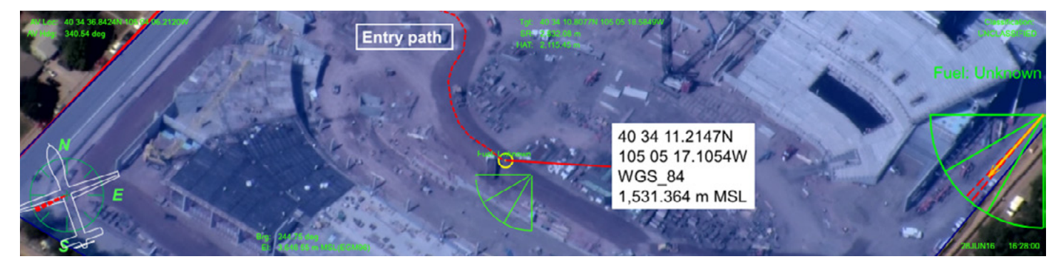
Analysis of video surveillance on a construction site; imagery courtesy of L-3 Communications, EO/IR Inc.