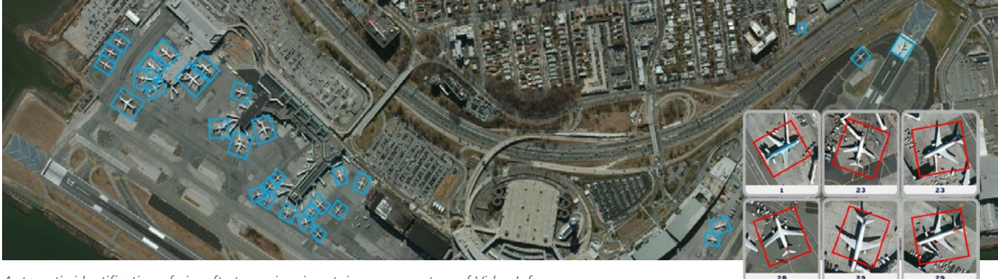
Automatic identification of aircraft at a major airport; imagery courtesy of Video Inform.

SOCET GXP is utilized by image, geospatial, and all-source analysts at organizations across the world: