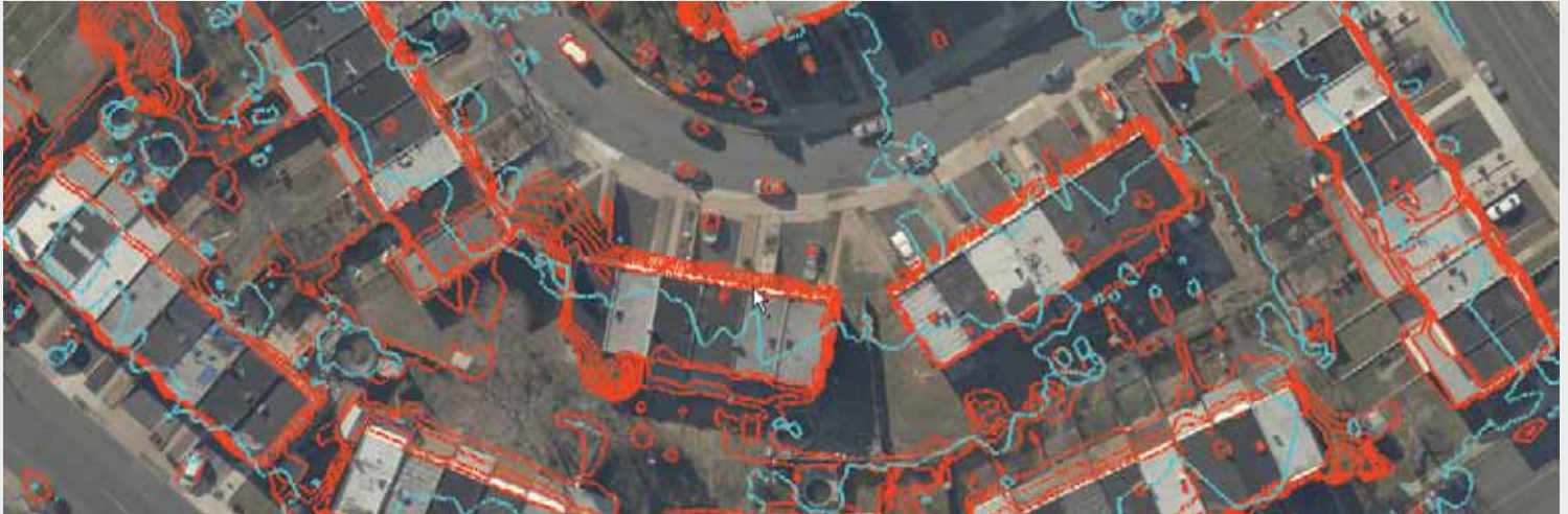
▲ Blue contours model the DEM generated with NGATE's DTM filter functionality. All buildings and trees have been removed during the extraction process without any manual editing. Red contours model the DSM that was generated simultaneously using NGATE.