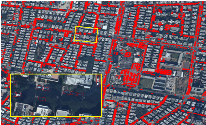
Identification and count of all vehicles in a suburban region.