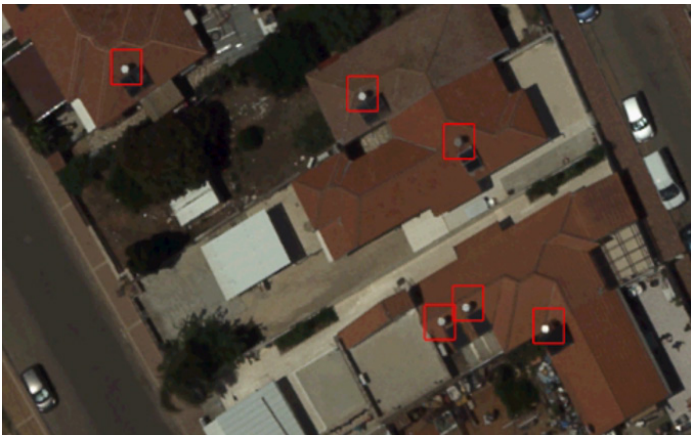
Identification of solar water heaters on rooftops of urban housing.