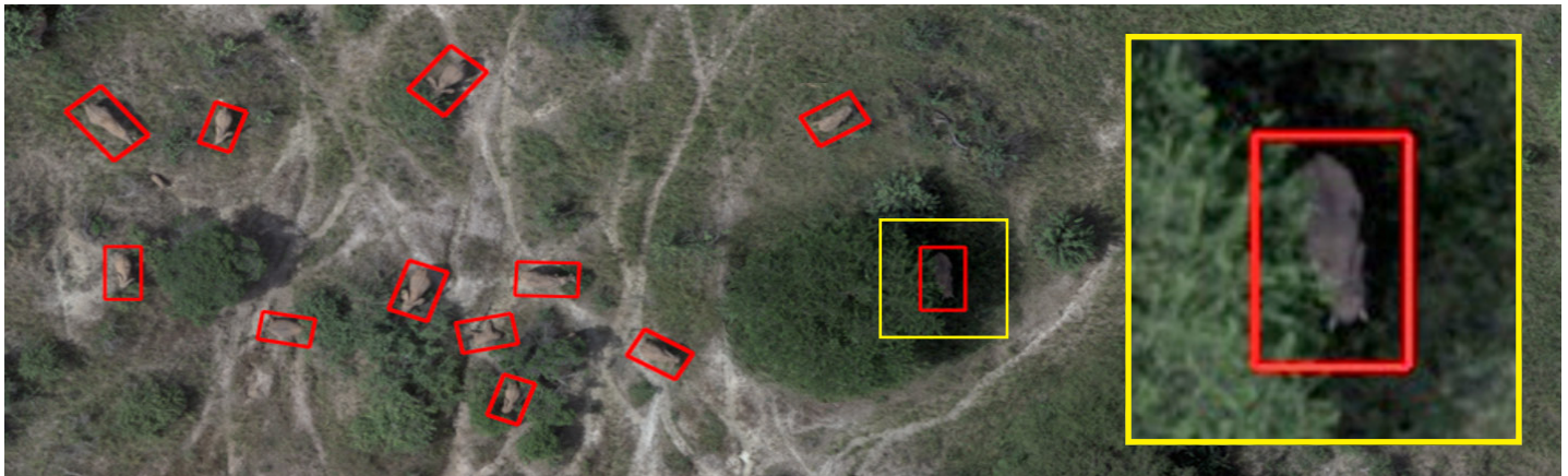
Observation of Savannah elephant population in sub-Saharan Africa.