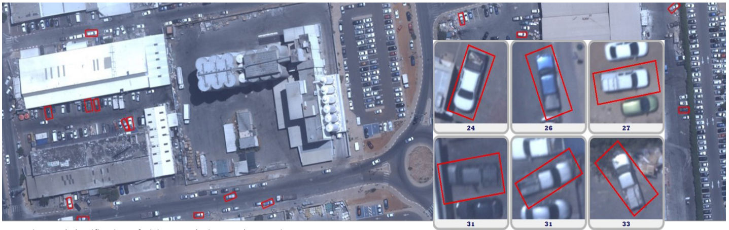
Detection and classification of pickup trucks in an urban environment.