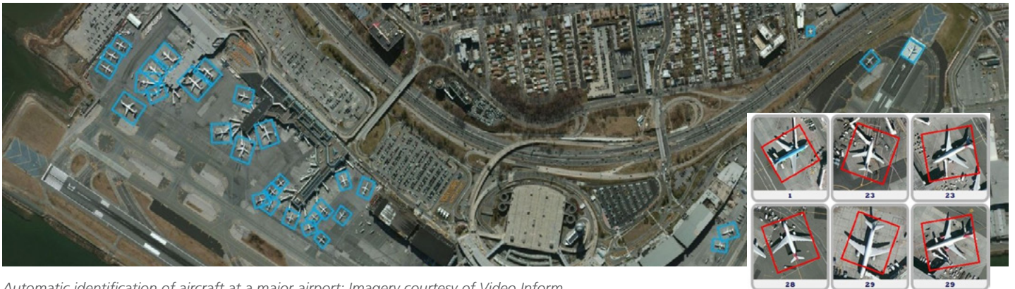
Automatic identification of aircraft at a major airport

SOCET GXP, and the entire GXP product ecosystem, is utilized by image, geospatial, and all-source analysts at organizations across the world: